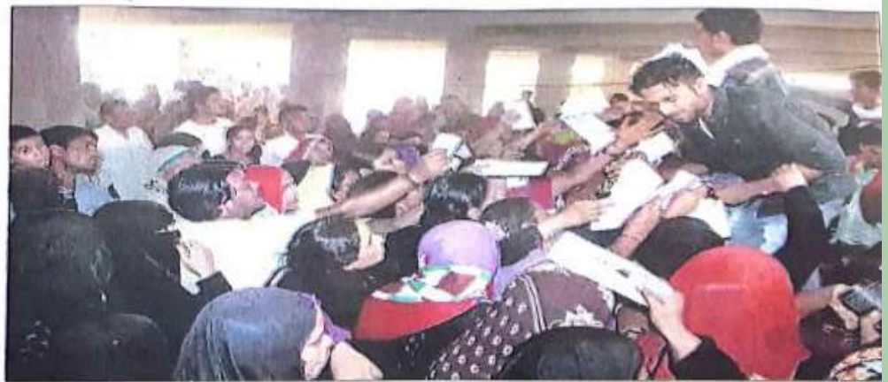
मथुरा नगर पालिका परिसर में सोमवार को आवास के लिए फार्म लेने वालों में जमकर धक्का मुक्की हुई। • हिन्दुस्तान

पड़ी। लाइन में न लागकर महिलाएं एक-दूसरे को धक्का देते हुए फार्म लेने को आतुर दिखीं। पहले ही दिन करीब 1000 फार्मों वितरित किए गए। फार्मों का वितरण 10 मई तक होगा। इस योजना के तहत अपनी जमीन पर मकान बनाने के लिए सरकार सहूलियत दे रही है।