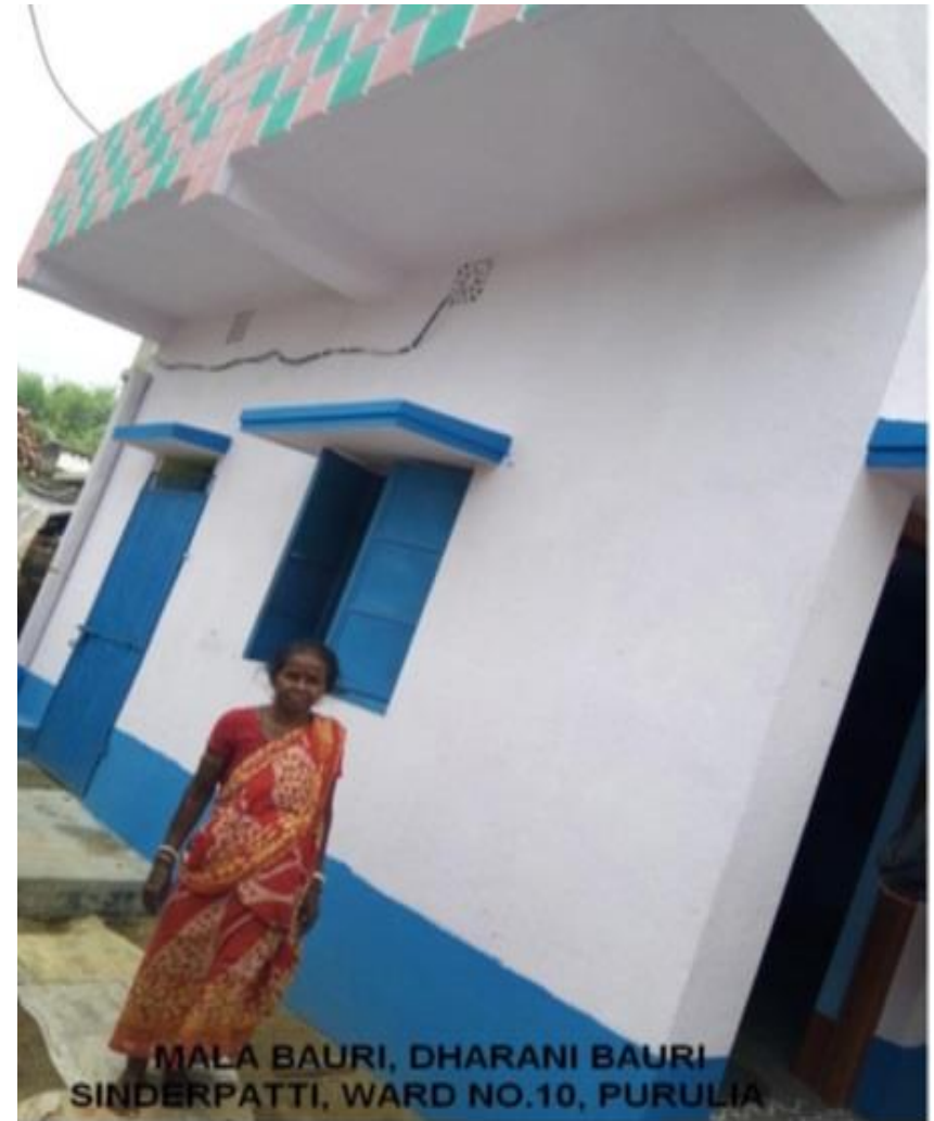
Purulia Municipality, Purulia District