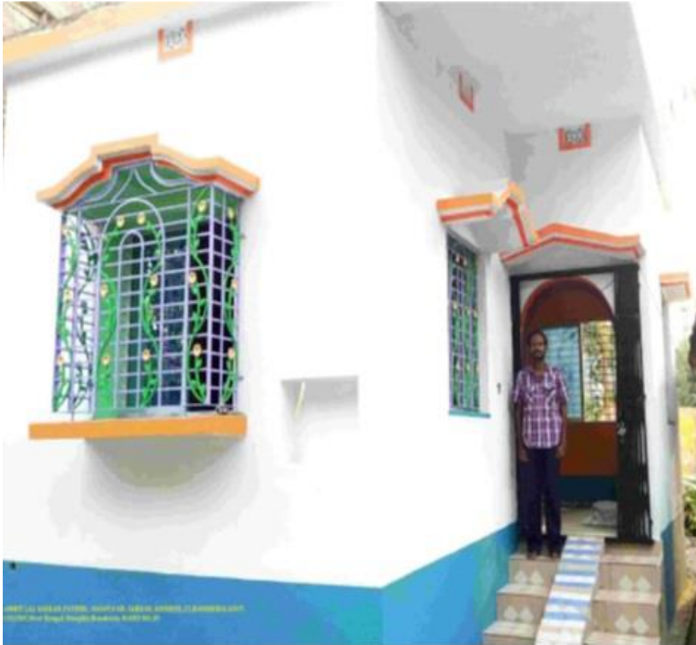
Bansberia Municipality, Hoogly District