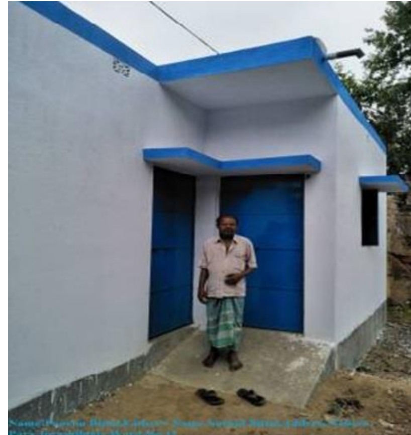
Suri Municipality, Birbhum District