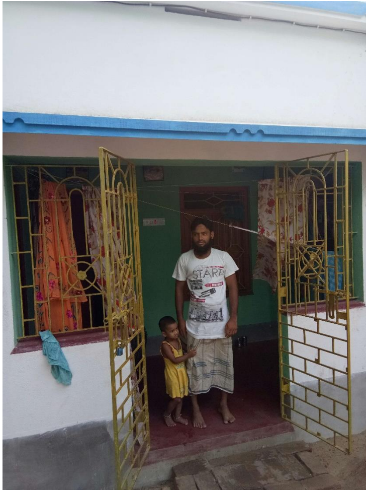
Contai Municipality, Purba Medinipur District