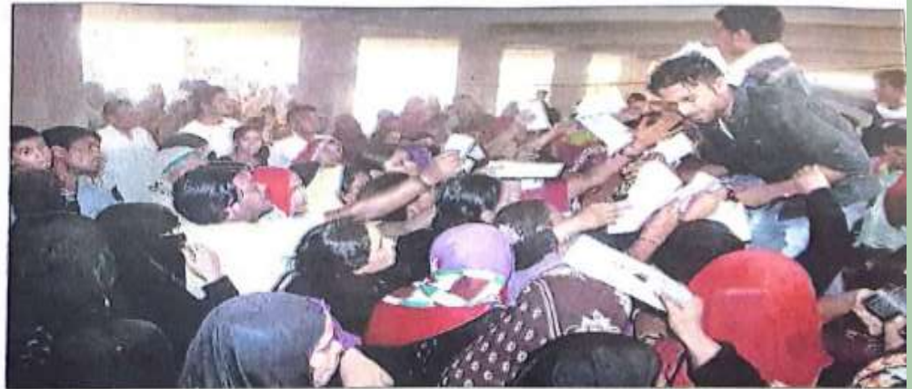
मथुरा नगर पालिका परिसर में सोमवार को आवास के लिए फार्म लेने वालों में जमकर धक्का मुक्की हुई। • हिन्दुस्तान

पड़ी। स्टाइन में न लागकर महिलाएँ एक-दूसरे को धक्का देते हुए फार्म लेने की आतुर दिखीं। पहले ही दिन करीब 1000 फार्मों वितरित किए गए। फार्मों का वितरण 10 मई तक होगा। इस योजना के तहत अपनी जमीन पर मकान बनाने के लिए सरकार सहूलियत दे रही है।