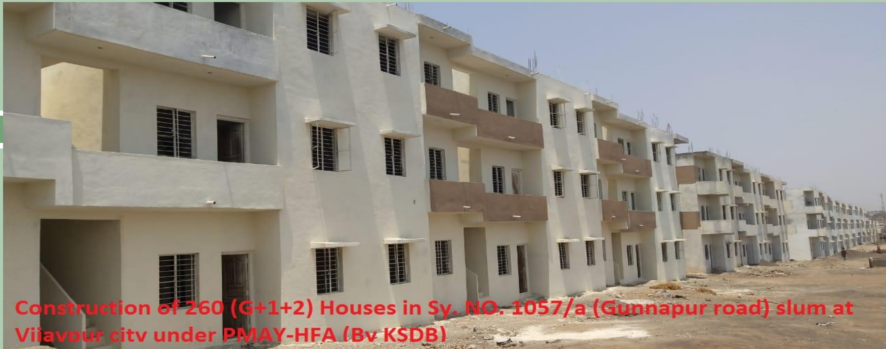
Construction of 260 (G+1+2) Houses in Sy. NO. 1057/a (Gunnapur road) slum at Vijayapur city under PMAY-HFA (By KSDB)