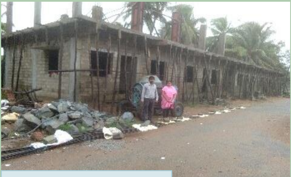
Karwar, Uttara Kannada Dist